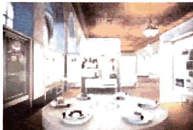
Lincoln Telegraph Key